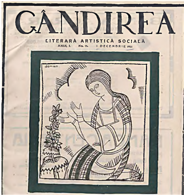
Figure 3.2. Cover of Gândirea magazine, December 1921.

cluded projects of religious nationalism introduced by Christian National Defense League (Liga Apărării Naționale Creștine, or LANC) founders Nicolae Paulescu and A. C. Cuza, as well as by the theologian Nichifor Crainic (1889–1972), who received funding from the Royal Foundations of Prince Carol and from the Ministry of Cults from the 1920s on and who became Minister of National Propaganda in the interwar right-wing regime (Ornea 1996).