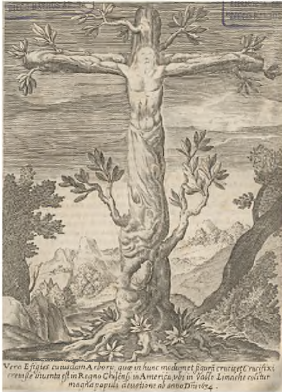
Figure 8.1. Limache Cross. Source: Alonso de Ovalle’s 1646 Historica Relación del Reyno de Chile (Historical account of the kingdom of Chile) (between pp. 58 and 59). © memoriachilena.

For Ovalle ( ibid. : 59) and his contemporaries this prodigious tree represented “such a great and new argument for [their] faith” that it reassured them in their missionary efforts. It symbolized in a meaningful and moving way “how faith begins to take root in that new world and that the author of nature wants the roots of the trees themselves to sprout and bear witness to faith no longer in hieroglyphs, but in the true representation of the death and passion of our Redeemer, as he was the only and effective means by which faith was planted” ( ibid. : 59). 30