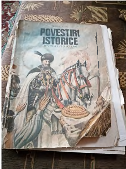
Figure 3.5. Almaș's volumes in my childhood home.

into the mountains to hide. Almost defeated, the Tatars ran from the Solca men into the mountains, where the Solca women attacked them and won. The sharp rocks where the women stood are called the Women's Rocks and are imbued with their spirits, which sometimes still haunt the cliffs, shrieking with their hair undone (1990: 121–22).