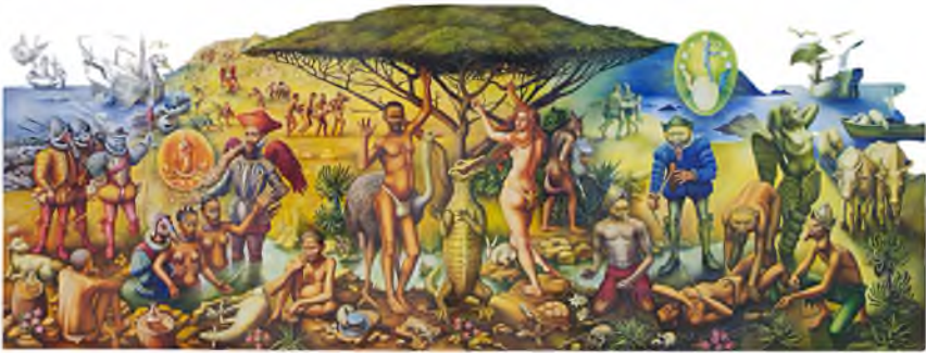
Figure 1.1. T'kama-Adamastor by Cyril Coetzee (1999).

side, but to find entirely new ways of looking” (Vladislavić 2000). Coetzee himself explains in his essay that he has tried to “make ironic and fantastic use of a variety of tropes and clichés of the colonial world-view” (C. Coetzee 2000: 3–4). This idea of “new ways of looking” that are “ironic and fantastic” is echoed in the volume’s subtitle, “Inventions of Africa in a South African Painting.”