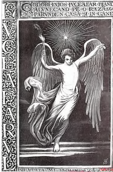
Figure 3.3. Cover of Luceafărul magazine, February 1904. © Wikicommons.

consensus that the Phanariot century kept the Romanian principalities from developing a well-formed bourgeoisie. Furthermore, Romania's social stratum of merchants and craftsmen was equally underdeveloped, making the young country unable to partake as a peer in the celebrations and successes of the age of nations (Călinescu 1972). The 1829 Treaty of Adrianople redressed this deficiency through the arrival of a high number of craftsmen and merchants of Russian Jewish origin who settled in Moldavian cities. This triggered the discontent of Romanian journalists, intellectuals, and other members of the bourgeoisie, whose anti-Semitism spread like wildfire.