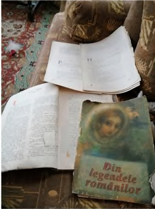
Figure 3.4. Damirescu’s book, tattered by time and misuse, in my childhood home.

some of the first stories my generation, among others, ever read, and they formed readers’ ideas about the Romanian nation and its Others. The first book below, Delia Damirescu’s Din Legendele Românilor (From the legends of the Romanian people), was published by the Ion Creangă publishing house in 1990. The Ion Creangă publishing house pioneered local book illustration, signing contracts with recognized artists who forged the way for rich, colorful, and innovative visual art, which contrasted with other aspects of the lives of children under the communist regime (Radu 2009).