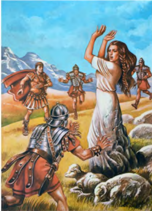
Figure 3.8. Scan from Almaș. Princess Dochia resisting colonization. © Valentin Tanase.

same battle, refuses to leave for Rome to become Trajan’s bride and turns to stone, becoming one with the mountain.