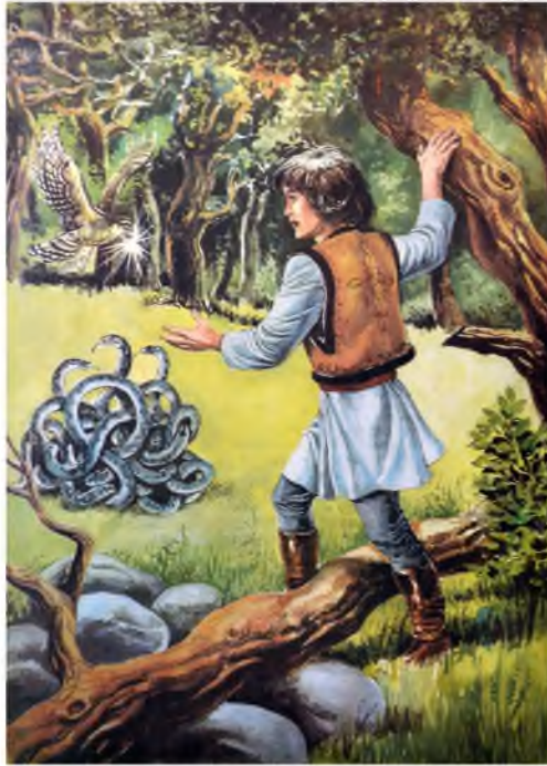
Figure 3.7. Scan from Almaș . Bestly sentient others stealing riches from a Romanian boy. © Valentin Tănase.

and abducting women and children). In one story, King Petru Rareș believes that to go to the sultan's palace is like willingly shoving yourself in the lion's mouth: "ca și cum te-ai băga, de bună voie, în gura leului" (54). In another story, the Turks fighting Mihai Viteazul are portrayed as packs of wolves and groups of wild boars charging at the Romanians: "Năpustindu-se, înghesuindu-se, lovind năprasnic în români, au trecut podul peste apa Neajlovului și au umplut locul, ca niște haite de lupi și turme de mistreții" (66). The revolutionary Tudor Vladimirescu addresses Phanariot rulers by calling them wolves and venomous snakes: "Până aici, hapsânilor și lupilor și șerpilor veninoși! Cu arma vă vom alunga din țară!" (99).