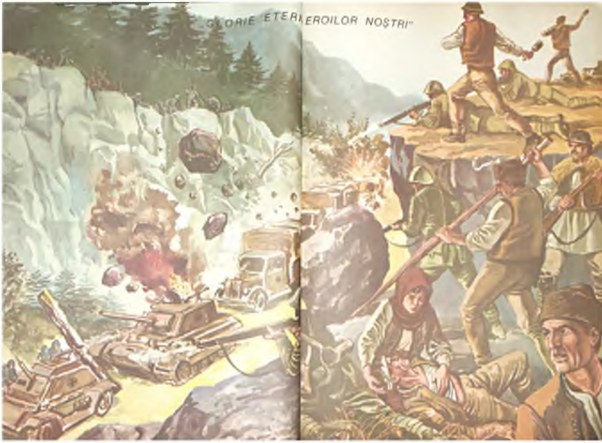
Figure 3.10. Scan from Almaș . Romanians attacking German tanks in World War II. © Valentin Tănase.

Sharing in the suffering of the martyred Romanian revolutionaries fighting against Austro-Hungarian colonization, the sentient landscape acts and reacts, mourning the arrest and upcoming execution of the freedom fighter Horea.