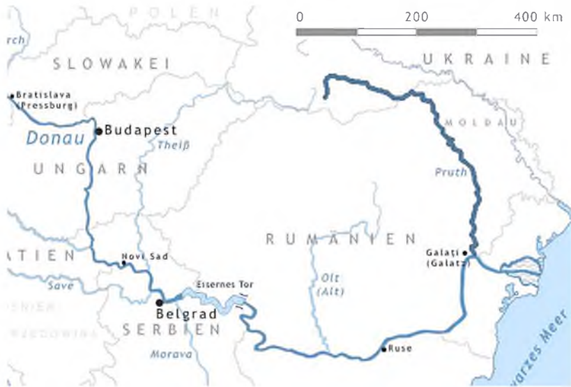
Map 3.2. The Danube, Prut, and Olt Rivers.

Coşbuc as a “Christian man,” a confidant who could understand the fright that the river felt upon meeting these barbarous Others, with their unkempt facial hair and their bloodcurdling eyes. The river itself tries to escape, hitting its banks, yet much like the Romanians, the river has nowhere to escape to—it is trapped in its banks, like the humans are trapped within the boundaries of their territories, captive to barbarian attacks.