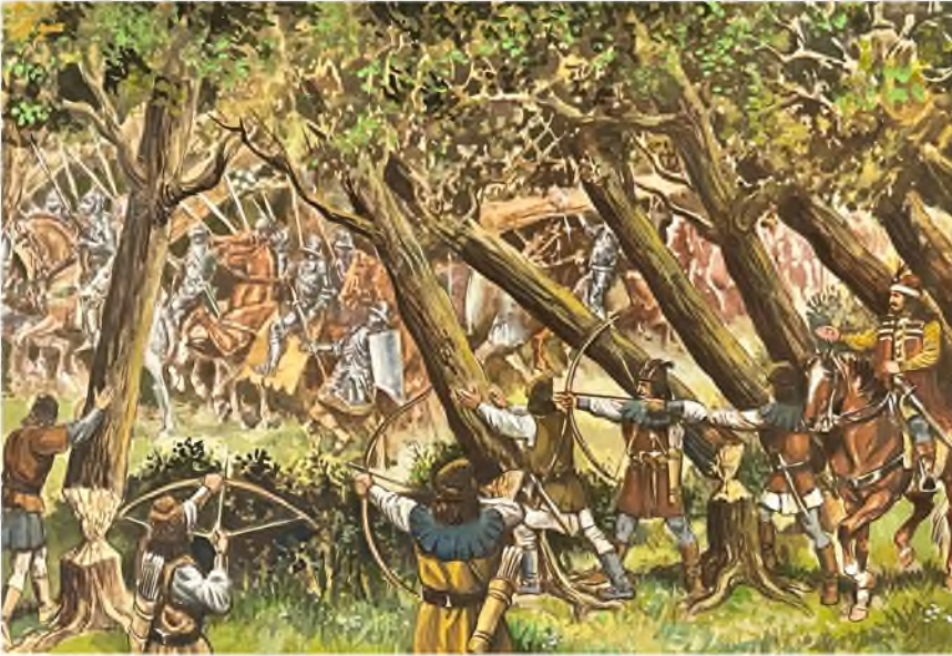
Figure 3.6. Scan from Almaș . Romanian archers and the xenophobic sentient landscape attacking. © Valentin Tănase.

The narrative of the stories is consistent. Dacians and later Romanians find themselves outnumbered, battling occupying foreigners and trying to reason with greedy Others who refuse their offers of peace and friendship. The technologies of the Romanians/Dacians is always behind, their leaders always autochthonous. The Romanians/Dacians prevail by devising clever plans involving the xenophobic sentient landscape, winning against all odds. The ethnic and religious military Other is often left at the mercy of the Romanian landscape, which guarantees victory for the Romanian army. The forest thickens and fog blinds the enemies at just the right time, leaving them surrounded by local archers; the valleys narrow before the enemies grasp the danger, allowing Romanian peasants to crush them under a deluge of boulders; swamps slow them, giving the Romanians the perfect opportunity to attack.