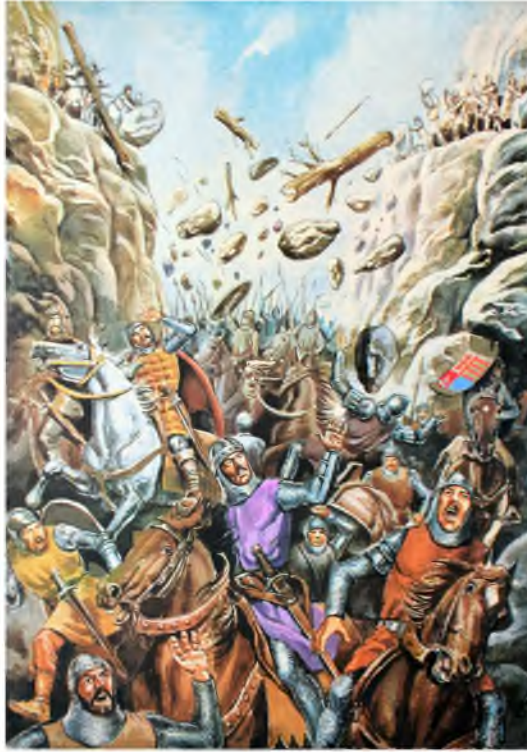
Figure 3.9. Scan from Almaş. Battle of Posada.

He hid in the mountains and forests. Because the mountain forest is brother of the Romanian and will protect him. There, he waited, in a gorge with very tall walls and so narrow that it wouldn't fit more than ten to twelve horsemen. That place is called Posada. The king ordered his soldiers to go up in the mountains and track the approaching enemy. Eager to capture Basarab, like you would a bear in its den, King Charles Robert advanced conceited, believing no one can defeat him. And he drove his troops into the Posada strait. Before he could realize it, they were caught in a deluge of boulders, logs, rocks, spears, and arrows. It seemed the mountains themselves were collapsing, ravaging them. (20) 15