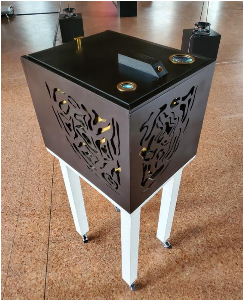
Figure 3. Swanson, Cole. Megachile Alienus , Installation view, 2022. Mixed-media. 240” x 96” x 2.5”. Sala del Camino, Fondazione Bevilacqua La Masa, Venice.

Anthropocene. 2 Megachile Alienus (2022) is a portable gallery, a cabinet of curiosities-meets-scientific laboratory (see Figure 3). 3 The black box is fitted with magnifying lenses, mixed-media installations, data visualizations, and altered bee specimens. The design embodies the ideological and political forces driving mainstream imaginaries on bees, revealing and disrupting the hegemonic practices responsible for their construction. Inspired by Anna Tsing's (2022) ideas on interspecies entanglements, the work embodies ontological edge effects , places of interspecies sociality “where touching and overlap occur even across varied projects of world making” (30).