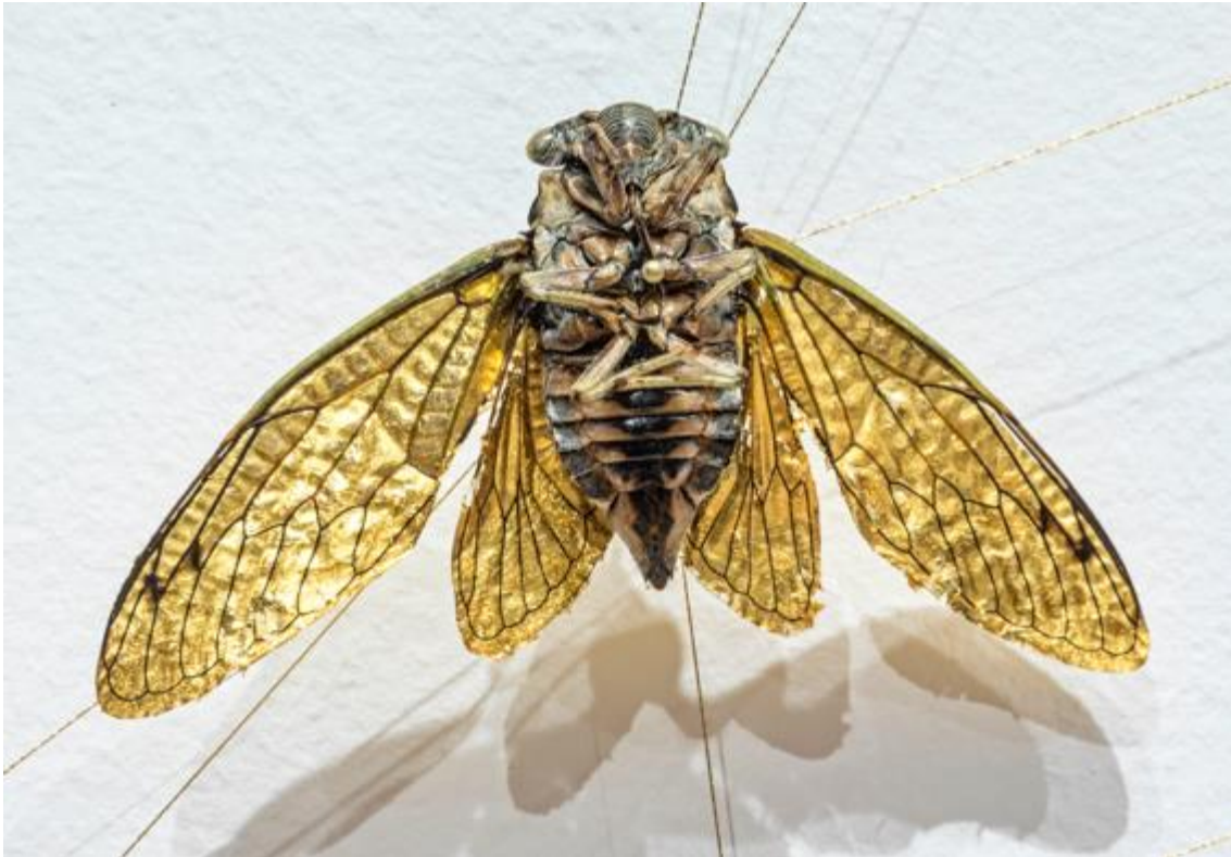
Figure 2. Swanson, Cole. Monument , Cicada detail, 2018. Reclaimed insects, 24 carat gold leaf, gold silk, and entomological pins, 240" x 96" x 2.5". Robert McLaughlin Gallery, Oshawa.

prejudices tenuously built upon human-interests that hinder our ability to recognize the miraculousness of the world's awkward creatures . 1 Conversely, the rituals and processes embedded in Monument echo Robin Wall Kimmerer's (2015) attestations that ceremony can "transcend the boundaries of the individual and resonate beyond the human realm. These acts of reverence are powerfully pragmatic. These are ceremonies that magnify life" (249).