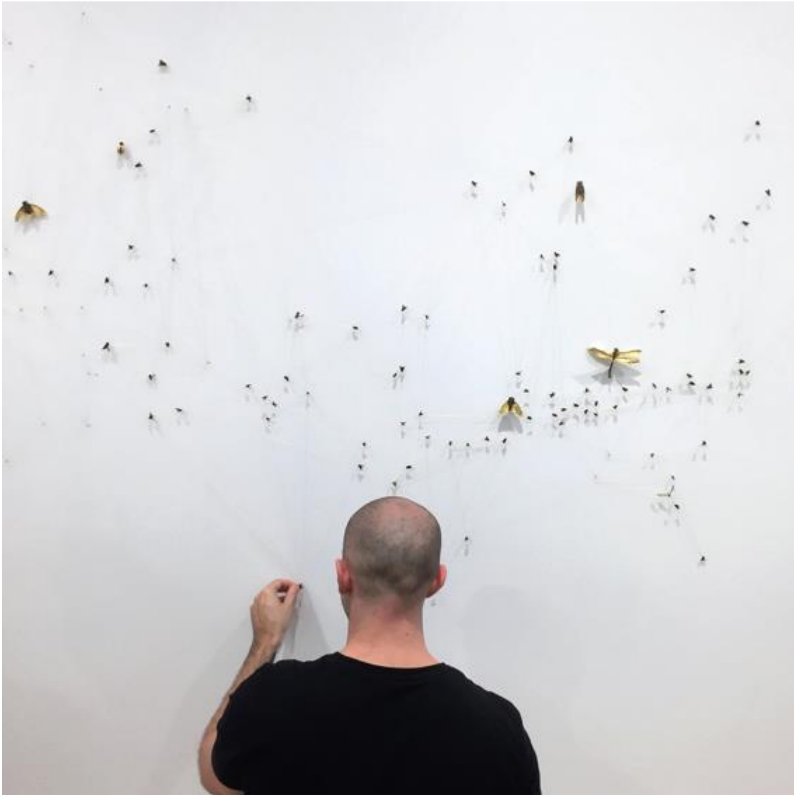
Figure 1. Swanson, Cole. Monument , Installation detail, 2018. Reclaimed insects, 24 carat gold leaf, gold silk, and entomological pins, 240" x 96" x 2.5". Robert McLaughlin Gallery, Oshawa.

When it comes to insects, it makes perfect sense to begin the journey in death. In recent years, a crescendo of frenzied voices rose up after startling reports on global insect losses were released (Entomological Society of America 2019). Anxieties about the ecological and economic implications of rapid and widespread insect declines were fueled by the sobering realization that the anthropogenic stressors responsible are not simple but manifold and complex—"death by a thousand cuts" (Wagner et al. 2021, 2). The loss of typically abundant species is a major cause for concern among researchers in the entomological community. There is a new urgency to ensure the flourishing of not only common-variety insects, but also the expansive network of lives that such creatures